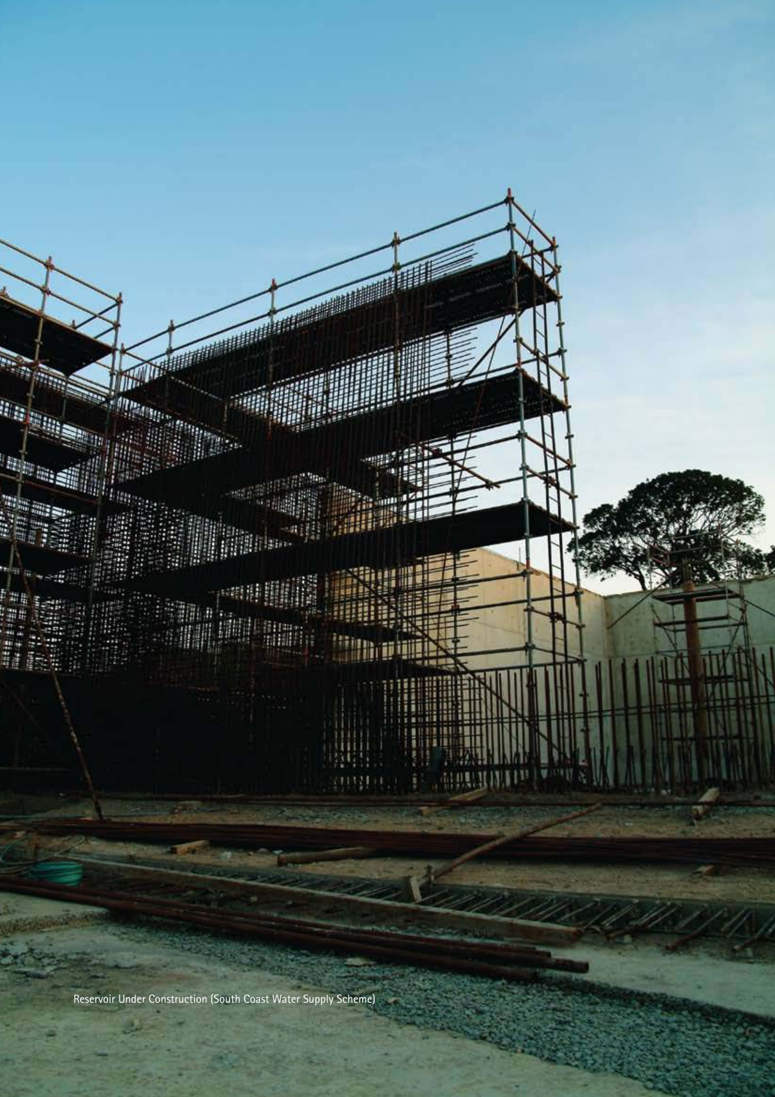
Reservoir Under Construction (South Coast Water Supply Scheme)